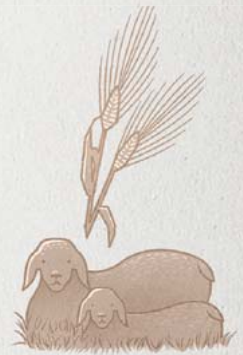
Giving the firstfruits of the harvest and the firstborn of the flocks to Jehovah