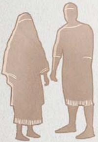
Marrying only those who worshipped Jehovah

Continued support of theocratic arrangements included: