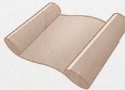
Observing the Sabbath