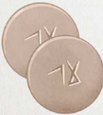
Making monetary contributions