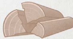
Supplying wood for the altar