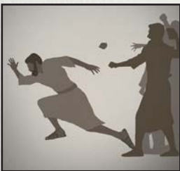
Fear of Man